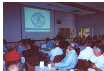
Participants at the 6 th Annual Principals/Athletic Directors Workshop

T he RIIL 6 th Annual Principals/Athletic Directors Workshop that was held on Thursday, September 19, 2002 was well attended and resulted in a very positive response from those who participated.